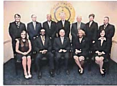
West Virginia State University Board of Governors 2014-2015